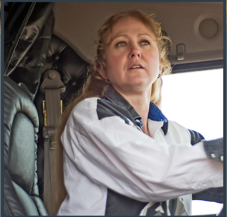
Women of Trucking Advisory Board