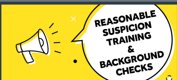
Cayuga DNA Offers Reasonable Suspicion Training & Background Checks